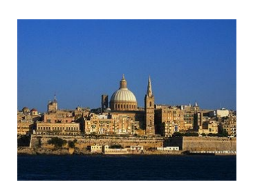
Figure 1: Valletta Skyline