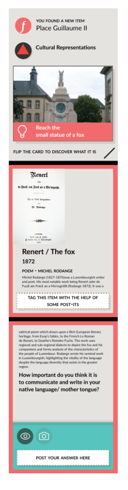
Figure 3 : Iteration 2 of postcard booklet (page 1 to 3) Top: find a location; middle: discovering content; bottom: contribute a response to a reflection question

We conceptualized this serious game as a geo-located experience for a number of reasons. The city can enhance engagement by providing embedded learning opportunities in an authentic environment [15]. The game motivates players, increasing their chance to engage in emotive and immersive reflection [5][14][20]. The city is inherently more immersive and socially inclusive than a virtual exhibition or indoor venue, both of which pose constraints and social barriers to access [4][13] [25]. As an immersive environment, the city offers physical clues that can be heard, touched, observed or emotionally felt [17]. Hence, it is more than a backdrop for a game. Furthermore, as the city is a manifestation of social and spatial transformations through time [18] it makes sense that it forms part of the user experience.