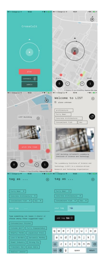
Figure 11: Screenshots of first version of the Technology Prototype. Top: locating content; middle: discovering content; bottom: reflective tagging of content