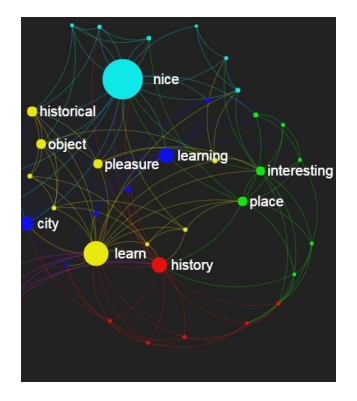
Figure 6: Key words of players in response to object discovery, round 1 of play test. Highlighting concepts of history, learn, interesting and nice.

different interactions possible. This featured a map of the game so that players could plan ahead while others were playing and track their visited POIs. The POI booklets were refined too, with shorter questions and groupings of POIs into reflective topics. The initial 8 curated tags were expanded to 50, selected from a list and written on small post-its (Figure 5). Treasure cards were adapted into story cards: players could select two different symbols (a house, a heart, a border crossing etc.) that were meant as writing prompts for players to reflect and share a personal migration story.