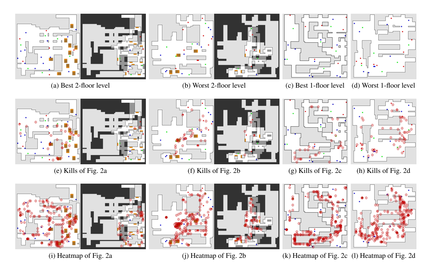
Figure 2: Best and worst among the fittest evolved shooter levels among 10 individual runs. For two-floor levels, the left map is the first floor while the right map is the second (top) floor. Large brown rectangles represent stairs to the second floor, red tiles represent weapons, blue tiles represent healthpacks and green tiles represent spawnpoints. On the second floor map, white areas are free-floating balconies above the first floor, while dark gray areas are dug out from the walls of the first floor (and signify tunnels); light gray shapes represent the floor below it, to show where players can jump off to or aim at from the second floor.

happens on the first floor, based on heatmaps of several generated levels) and explore otherwise less visited locations.